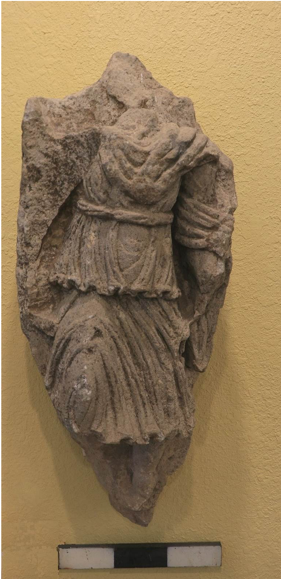
Figure 2a. Winged Nike sculpture (© Moath Al-Fuqaha).