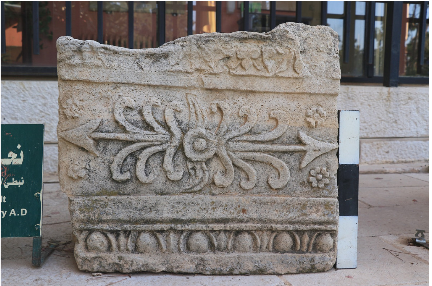
Figure 1a. The Nabataean Thunderbolt sculpture.

cause of weather factors, but it is now being cleaned. The Thunderbolt is believed to have been found within the threshold of the altar, which dates to the third period of the altar's construction to the first quarter of the first century CE. It is partially damaged and contains deposits of foreign material accumulated over time. The sculpture is 42–47 cm long, 53 cm wide, and 25 cm deep.