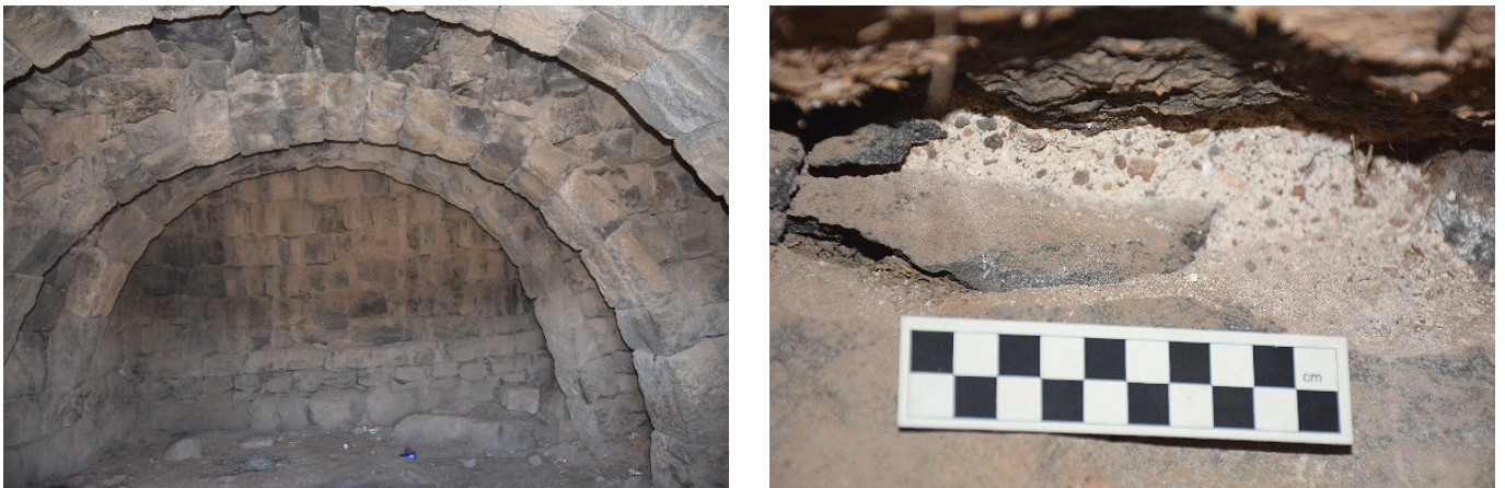
Figure 3. Samples from site 2, S2a (left) and S2b (right), collected from an adjacent room, specifically at the same height level as Sample 1, to minimize the influence of external contaminants such as dust or mud that might have accumulated on the surface.