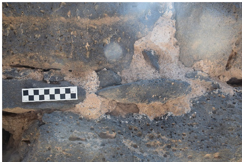
Figure 4. Sample from site 3 (S3), extracted from a semi-demolished room near the water tank at the entrance. This area has not undergone comprehensive excavation, and the sample was collected with caution to preserve its integrity, despite the room's unstable condition.