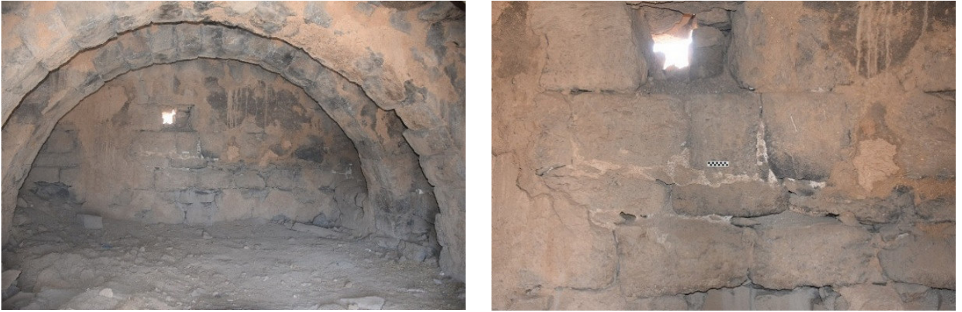
Figure 2. Samples from site 1, S1a (left) and S1b (right), obtained from the room located at the southernmost corner of the site, characterized by two arches. The sample was taken from the highest point of the room to ensure a representative and uncontaminated sample.